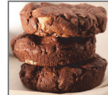
Double Chocolate Cookies