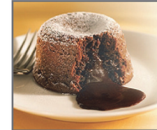
Molten Chocolate Cake