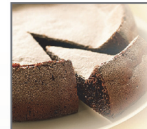
Flourless Chocolate Cake